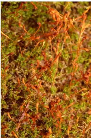
Fig. 1: ' Entosthodon subnudus var. gracilis ' by Fagg, M. (© Fagg, M.)