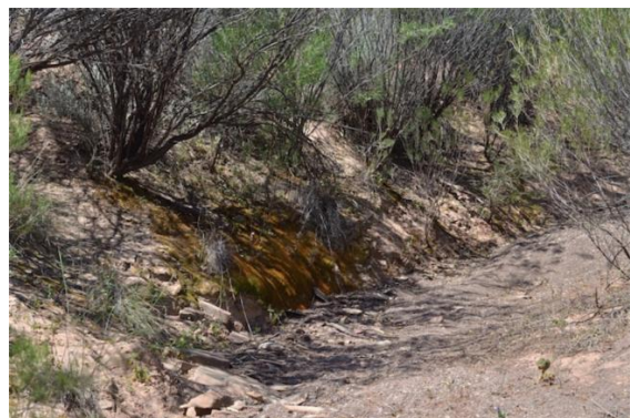
Fig. 2: ' Entosthodon subnudus var. gracilis ' by Fagg, M. (© Fagg, M.)